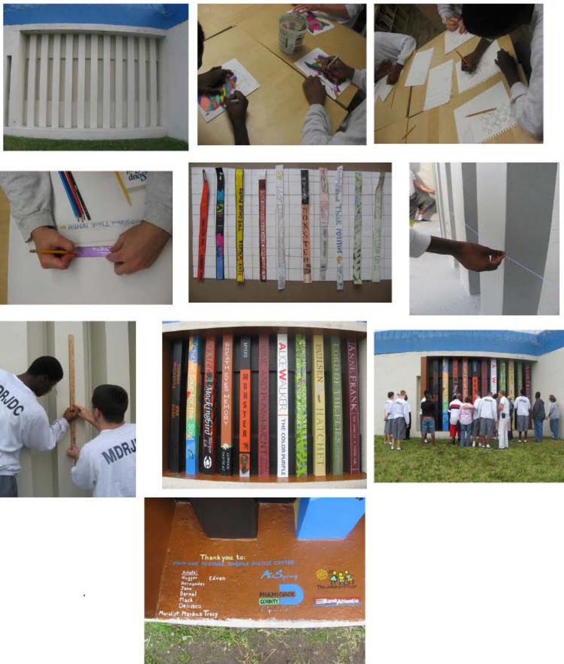
(1) Blank destination wall for "Bookshelf" mural, (2) Lesson on selecting, mixing, and applying colors, (3) Mural planning session, (4) Participant creates mural blueprint, (5) Blueprint of "Bookshelf" mural (6) Participants create a grid with chalk line, (7) Participants draw the outline of the mural, (8) "Bookshelf" mural, (9) Families gather to view the wonderful work of their children, (10) Artist and funder acknowledgements painted into the mural